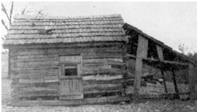
The birthplace of William Branham, Burkesville, KY.